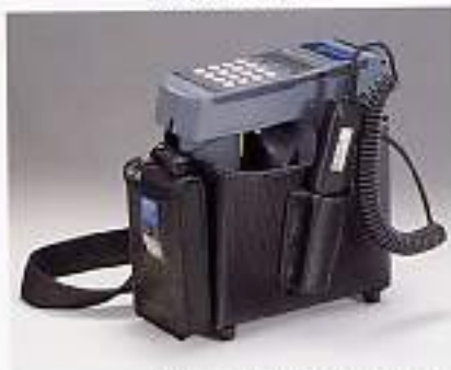
Holster for EP-950G LH-1010