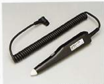
Pen scanner NP-01