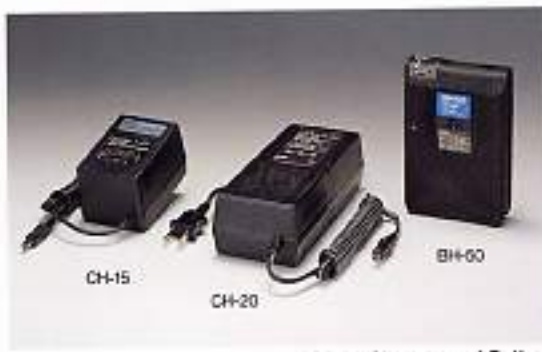
Battery Charger and Battery