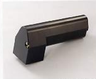
Battery grip 6108